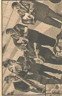
Open Rail Hammerstown